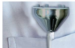
The protective sleeve with a clip holder. Always on you and ready to hand.