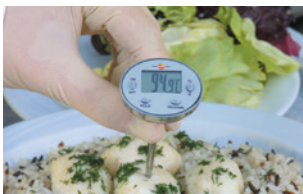
For temperature spot-check measurements in food production