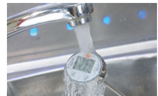
Simply rinse under running water when dirty.