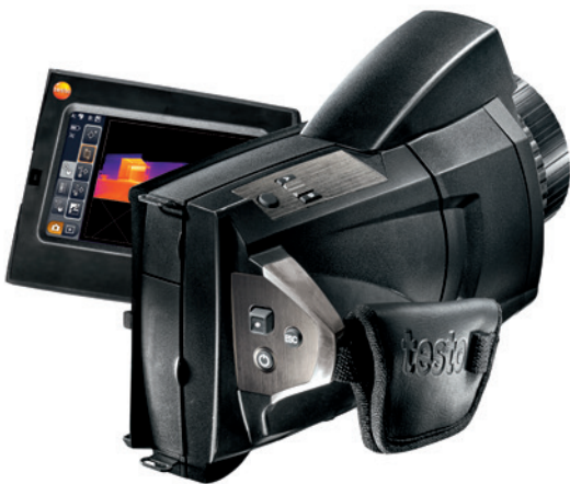
Thermal imager testo 885

More information and answers to all your questions concerning the topics of thermography and the panorama image assistant at www.testo.com .